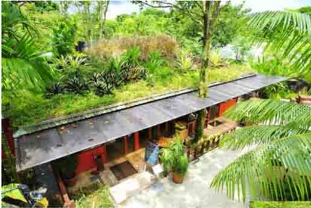
Aramsa Garden Spa, Bishan Park, Singapore Elmich, Far East