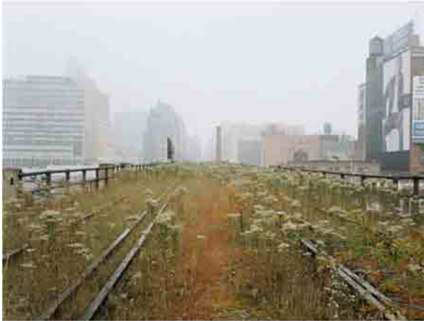
photo of the High Line in 2000