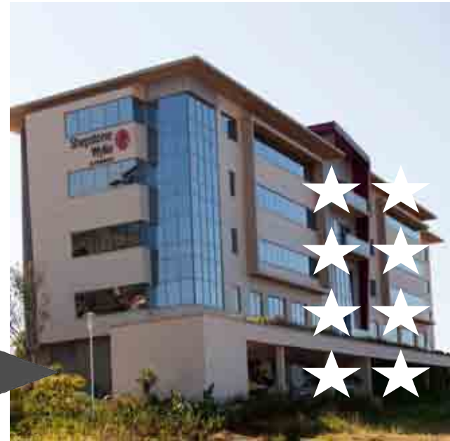
24 Richefond Circle