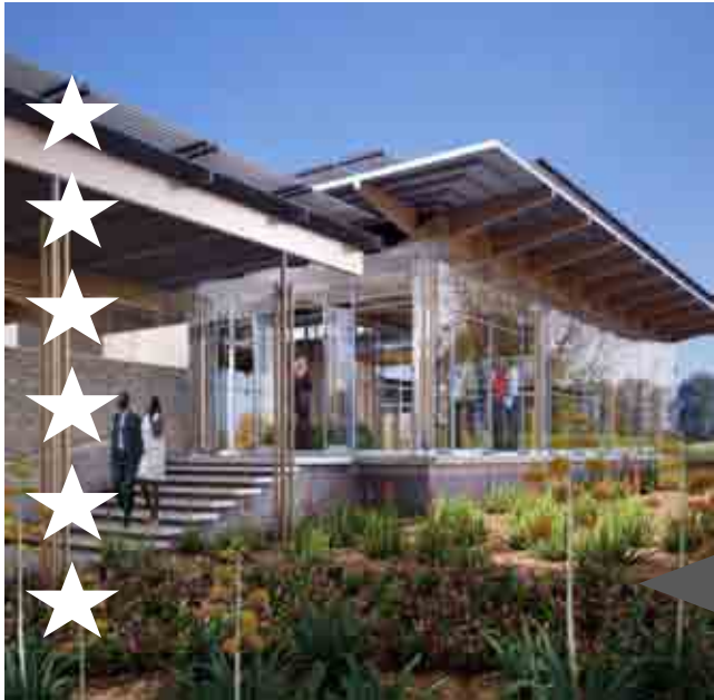
Vodafone Innovation Centre